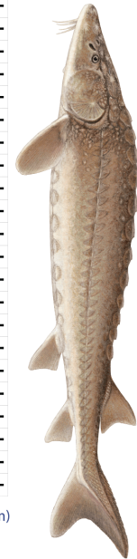
Lake Sturgeon (Acipenser fulvescens)